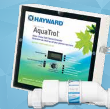
AquaTrol® and AquaTrol® Low Salt

AquaRite Pro is the integrated, professional-grade system that combines AquaRite salt chlorination with Sense and Dispense® chemistry automation. By automatically sensing and adjusting chlorine and pH levels, it creates perfectly balanced water with no measuring, testing or adjusting on your part. With AquaRite Pro, enjoy the most consistent water quality possible to minimize maintenance and maximize relaxation.