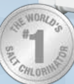
AquaRite® and AquaRite® Low Salt